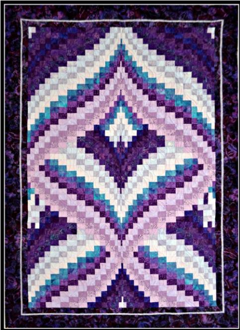
Aurora Borealis from Twist-and-Turn Bargello

This lap sized quilt is a great place to start exploring the world of Bargello quilts. We have combined a great assortment of fabrics into a kit so you don't even have to worry about picking out the fabric! Finished size about 42" X 58" with borders.